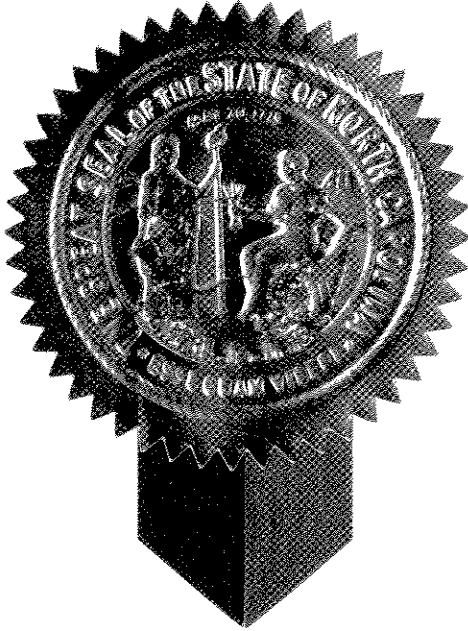
Beverly Eaves Perdue Governor

IN WITNESS WHEREOF , I have hereunto signed my name and affixed the Great Seal of the State of North Carolina at the Capitol in the City of Raleigh, this first day of October in the year of our Lord two thousand and nine, and of the Independence of the United States of America the two hundred and thirty-fourth.